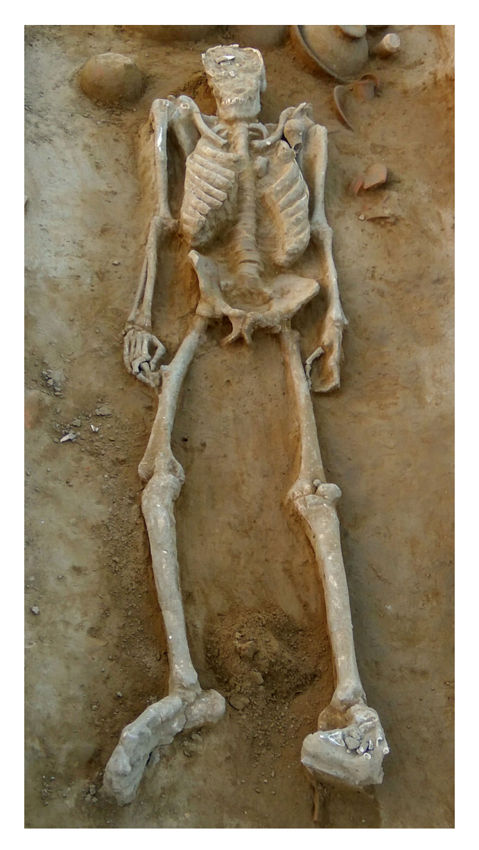
Figure 3. Primary burial of an individual from mature Harappan site showing sleeping position with pots to the north of the head.

world. The available archaeological data from a few excavated sites, for example, Rakhigarhi in Haryana state and Dholavira in Gujarat state in the northwest India, clearly demonstrate that the Harappan civilization developed gradually from the beginning of settled life dated around 7000 BCE. Globally, people have always been curious to know more about this great and unique civilization. In the absence of aDNA, however, it has remained a mystery how the people of the Harappan civilization formed from earlier groups and contributed to later ones. Excavations at Rakhigarhi and Dholavira explored human burials (figure 3). Obtaining sufficient DNA from these skeletal remains, and rigorous scientific sampling and analysis of the same, would lead to a breakthrough to understand the prehistory of India.